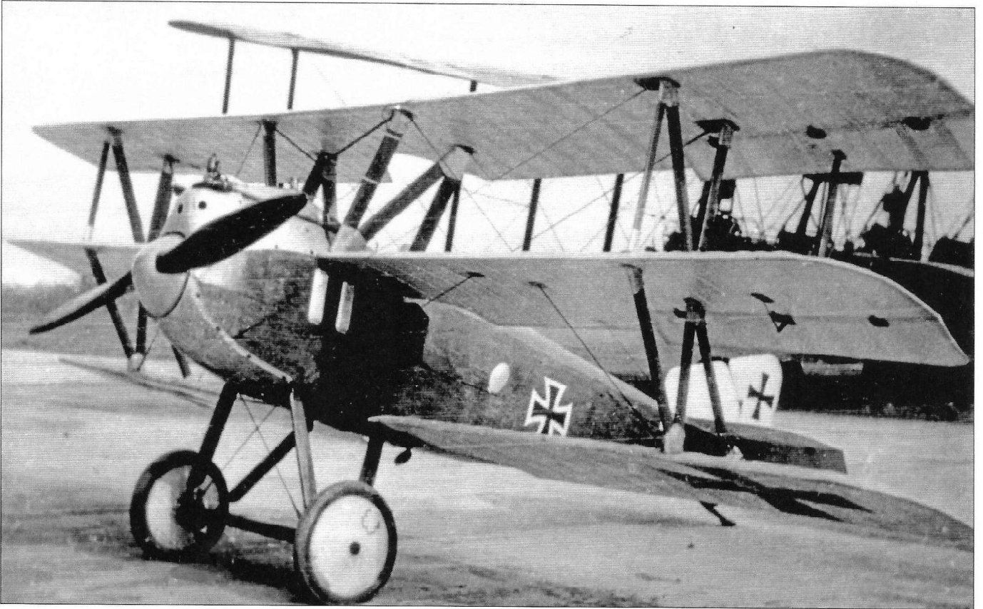
Above & Below: The Schütte-Lanz Dr.I used the fuselage and tail of the D.III biplane but had lower performance due to its greater weight and drag. The Dr.I was Germany's last triplane fighter and marked the final end of Germany's triplane craze.